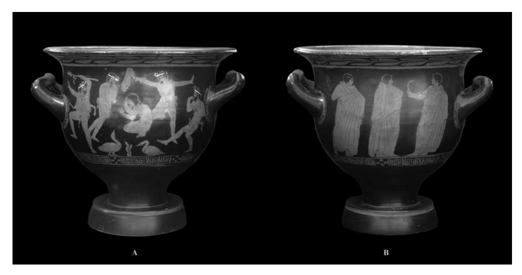
Fig. 3. Athenian red figure bell krater, woman bathing surprised by Silens (A); two youths and boy (B). Ripe Classical period, the Dinos Painter, ca. 420-410 BC. Institute of Archaeology, Jagiellonian University, Kraków, inv. no. 331, height 0,30 m.

University Museum (four objects<sup>13</sup>). New pictures of all the objects were taken as well as section drawings of all the vessels and drawings of decorations and other details (e.g. inscriptions) of the objects where those elements were poorly visible or poorly preserved or omitted. Detailed descriptions of the vases were made regarding both the techniques (e.g. a description of ware or fabric using the Munsell's Soil Colour Chart), shapes, decorations and the state of preservation. The most exact classification and dating possible of all the objects was conducted on the basis of a detailed analysis and various analogies.