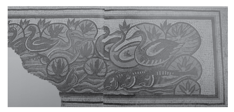
Fig. 2. The birds in the Nilotic mosaic. The Church of Sts. Lot and Procopius in Khirbet el-Mukhayyet, AD 557.

Guvrin). 'The meadows' are suggestive of different plants as lotus flowers, nenuphars, or papyri. 'Lotus, papyrus and oleander plants fill the space in a similar manner in all the pavements and represent and distinguish the Nilotic landscape'<sup>11</sup>. I had the good fortune of seeing the Nilotic mosaic of Tabgha in situ (5<sup>th</sup> century) (Pl.I). This mosaic is conspicuous for the wide range of species it presents. It belongs to a class of Nilotic mosaics which call to mind pages of illuminated codices with atlases of birds. In Tabgha we can recognise a cormorant, a dove, ducks, a goose, herons, a swan and a flamingo killing a snake. The Nilotic landscape in the Church of S.John the Baptist also included herons and ibises<sup>12</sup>. The birds in the Nilotic mosaics are frequently depicted with the use of splendid, fresh colours for their plumage to cheer the eyes of the viewers (Sts. Lot and Procopius in Khirbet el-Mukhayyet (Pl. II-III), Casa del Fauno in Pompeii, Tabgha).