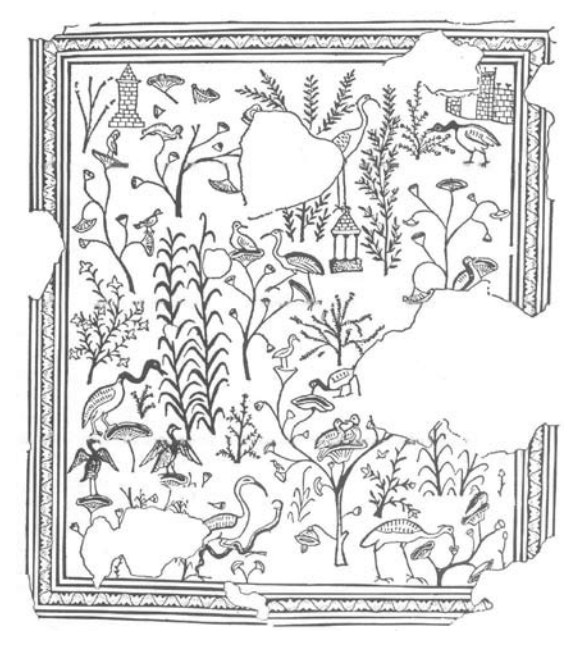
Fig. 1. The Nilotic mosaic in the Church of Multiplication of Loaves and Fish, Tabgha, 5th century.

The church was a timberroofed. triple-nave basilica supplied with upper galleries (γυναικωνίτις) and provided with a spacious square atrium (προτεμένισμα)<sup>3</sup>, which consisted of four columned porticos (τέτρασι στοαῖς ἁβρυνόμενον), and a façade strengthened with two towers (πύργοι). Choricius did not forget to add that the columns of the atrium gleamed 'whiter than snow' (Il. 20, 437) (LM II, 31). Let us note a couple of other architectural details. A high staircase led pilgrims up from the road to the western portico of the atrium (\pi \lambda \hat{\eta} \theta o \varsigma) βαθμῶν) (LM II, 29). Twin towers like the ones which once